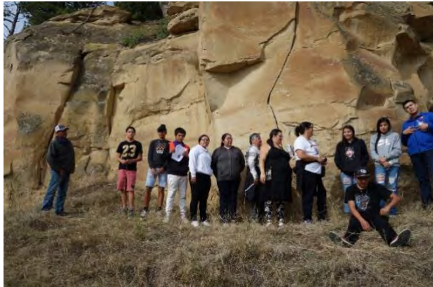
(Left) Pryor school students crossing the irrigation ditch on the way to the site. (Right) Group of the students in front of the cliff wall with the Crow Indian war honors petroglyphs.

SSR started an important new program to offer cash awards up to $7000 for research related to pictograph and petroglyph sites in North America. The goal is to increase the number of rock art sites, or portions of these sites, that are recorded according to standards accepted by SSR. All sites are considered for support, but those located on private lands (where there is little opportunity for support from a land managing agency) are considered more appropriate for funding from this program.