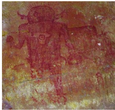
(Left) Unmodified view of the panel. (Right) DStretch photograph which shows the details of the panel. The faded nature of the painting explains why it had not been found in previous work in the area.