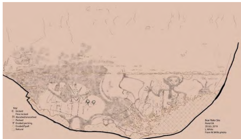
Laurie White drawing of the high panel on the Wold Ranch.